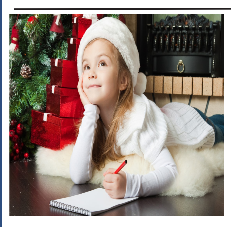
Go to www.southerngasfcu.com or login to our mobile app and make the holidays even happier this season.

Let SGFCU's e-Services simplify your life. For more information, contact us today!